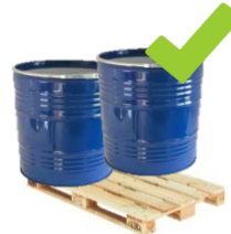
Material in 200l iron drums on wooden palette