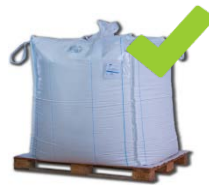
Material in Big Bags on wooden palette