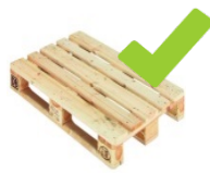
Material directly Strapped on wooden palette