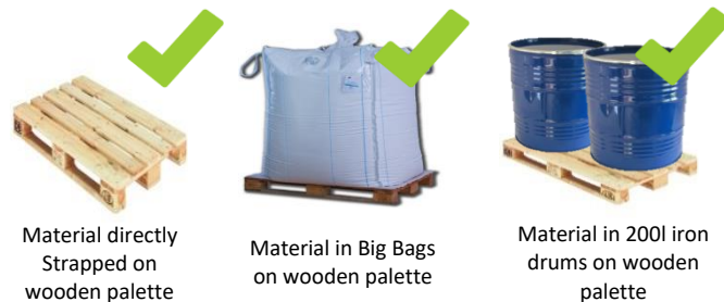
Material directly Strapped on wooden pallet